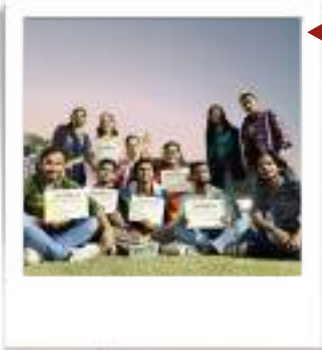
Won First position in Nukkad Natak in X'ANIMO'23 organised by Suresh Gyan Vihar University