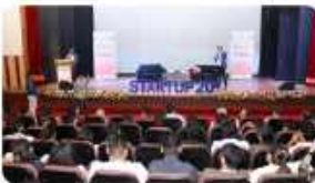
Startup20x Rajasthan Sabha

Capacity 360° represents 60+ Capacity Building Sessions designed to equip founders with essential entrepreneurial skills. The sessions span business, finance, market research, branding, prototyping, pitching, leadership, and team building. Led by industry experts and seasoned mentors, each session delivers practical, real-world insights founders can apply immediately. 60+ sessions later, ACIC-VGU continues to build confident, capable, and future-ready entrepreneurs – one session at a time.