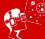
AR / VR