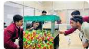
Student Innovator Program