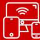
Electronics & IT