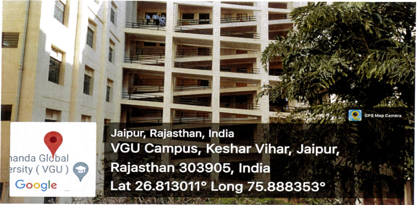
Geotagged photograph showing the availability of ramps in the institution building for the ease of mobilization of differently abled individual