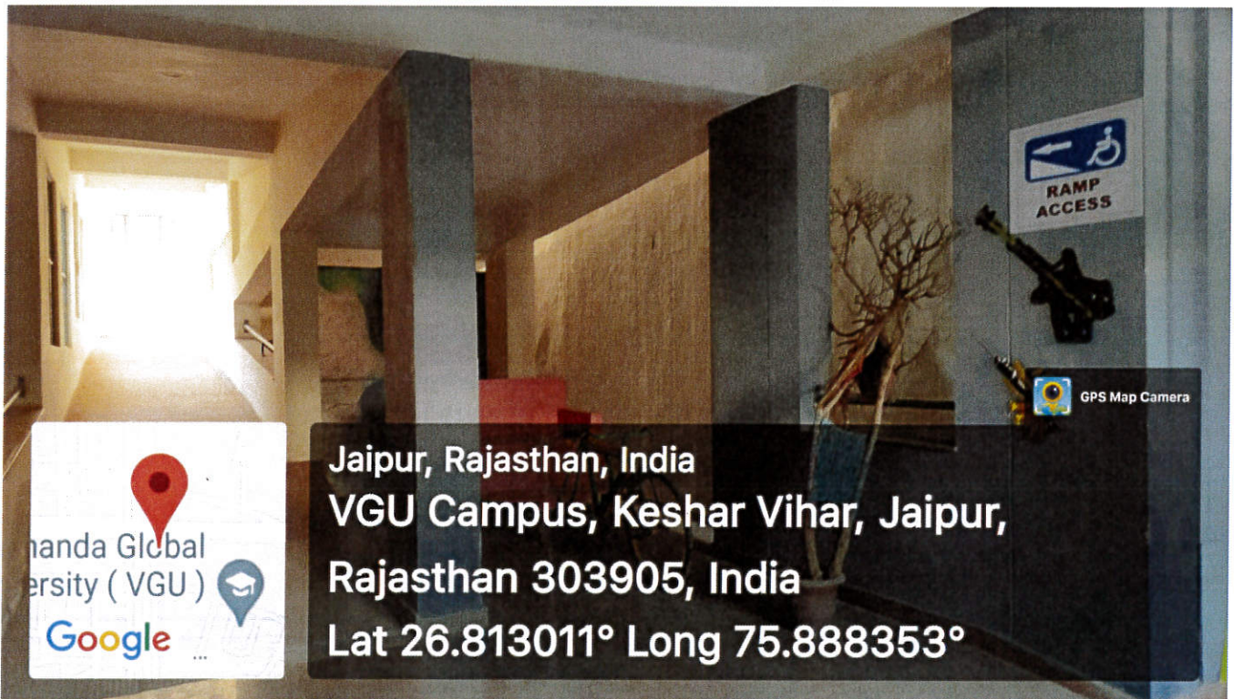
Geotagged photograph showing the availability of signposts & display boards for Divyangjan