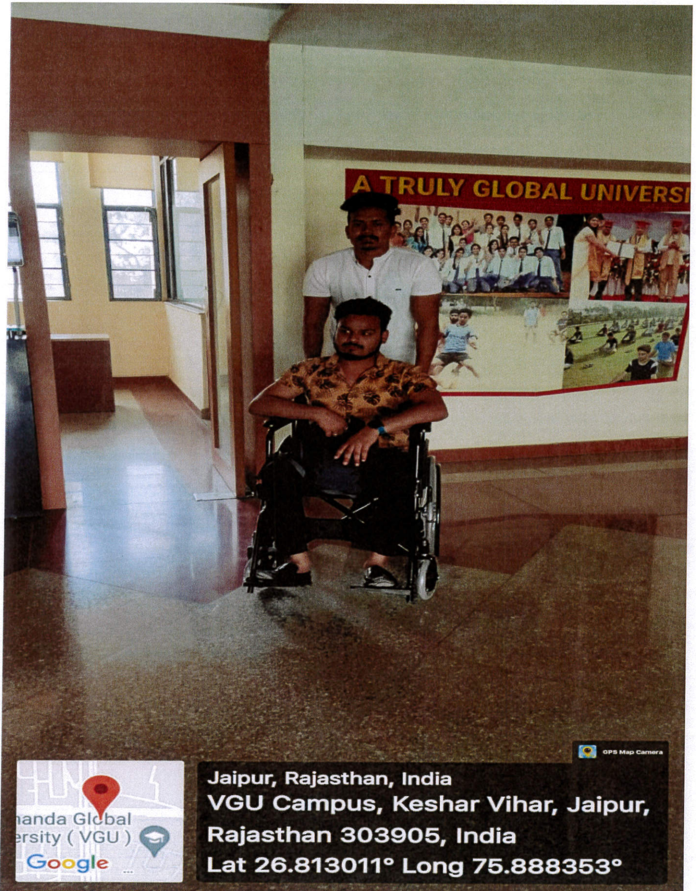
Geotagged photograph showing the availability of wheelchair for differently abled individual