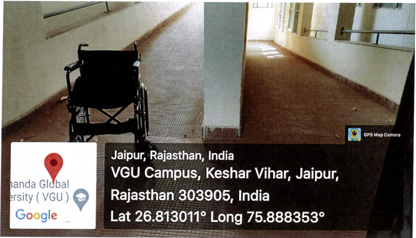
Geotagged photograph showing the availability of wheelchair for differently abled individual