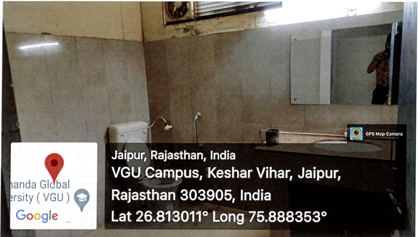
Geotagged photograph showing the availability of separate washrooms for Divyangjan