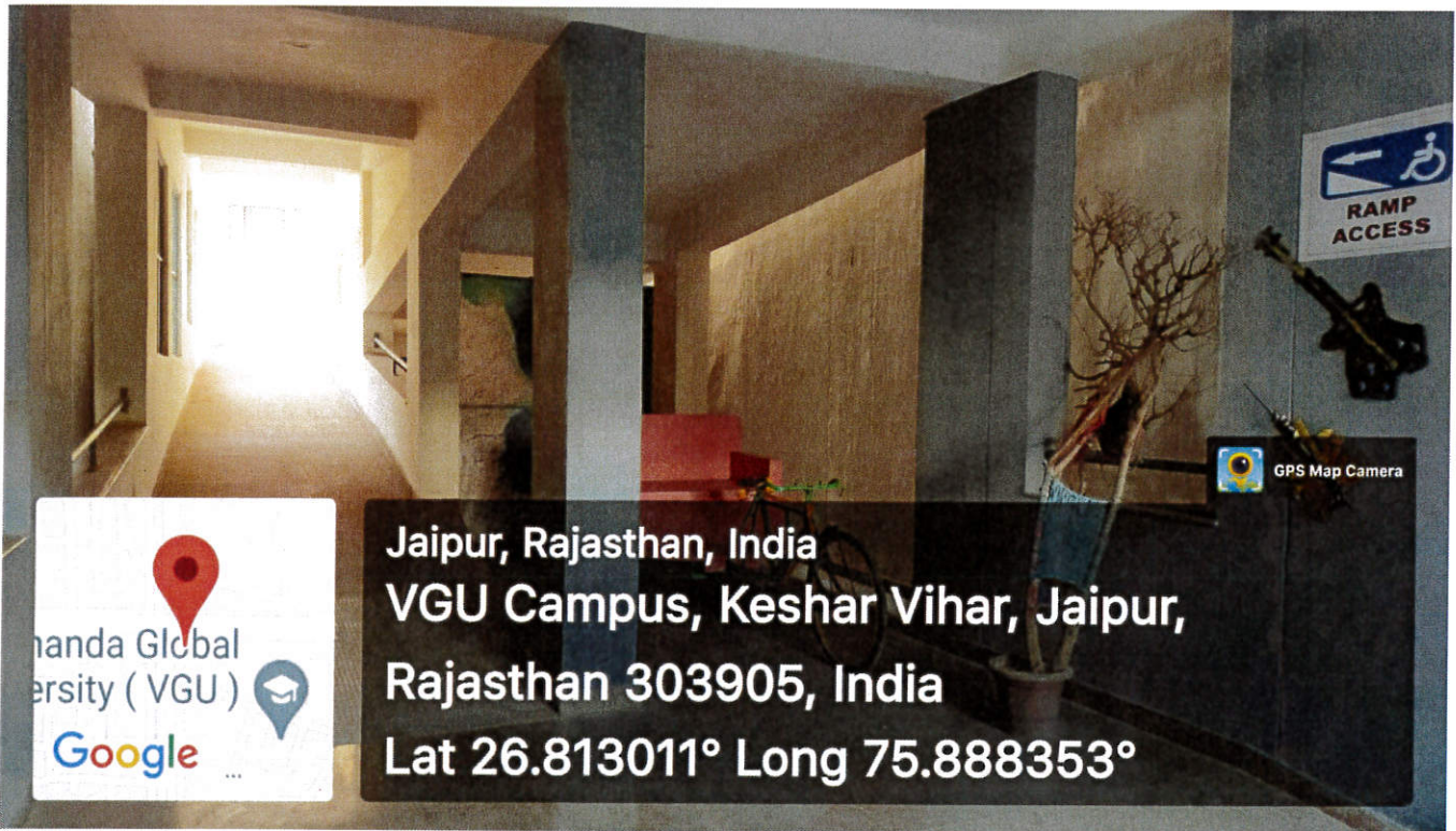
Geotagged photograph showing the availability of ramps in the institution building for the ease of mobilization of differently abled individual

[Handwritten signature] For VGU Register