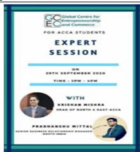
Expert Session for ACCA Students