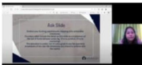
5. Questions !!