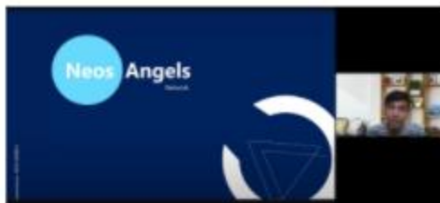
1. Tushar Saini introducing the guest.