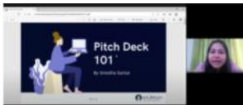
3. Discussion on What is a Pitch Deck