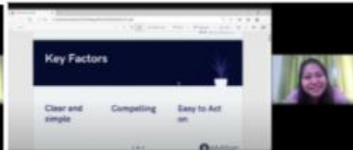
4. Key Factors of a Pitch Deck