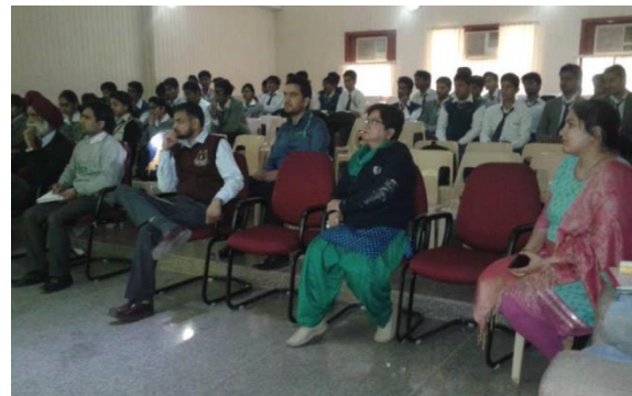
Faculty and students attending session