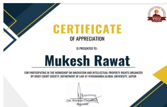
Sample participation certificate