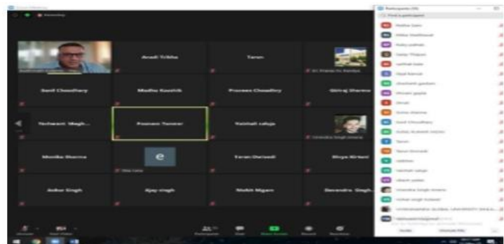
1. Welcome Speech