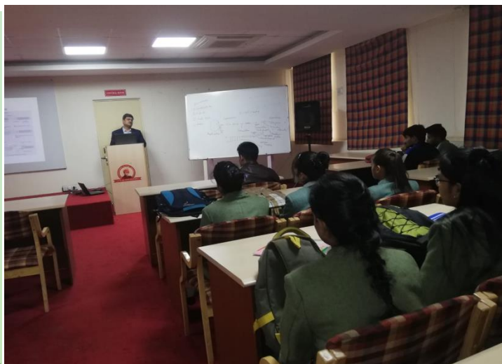
Students attending lecture at VGU seminar Hall